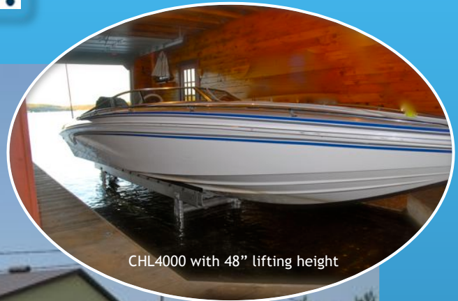
CHL4000 with 48" lifting height