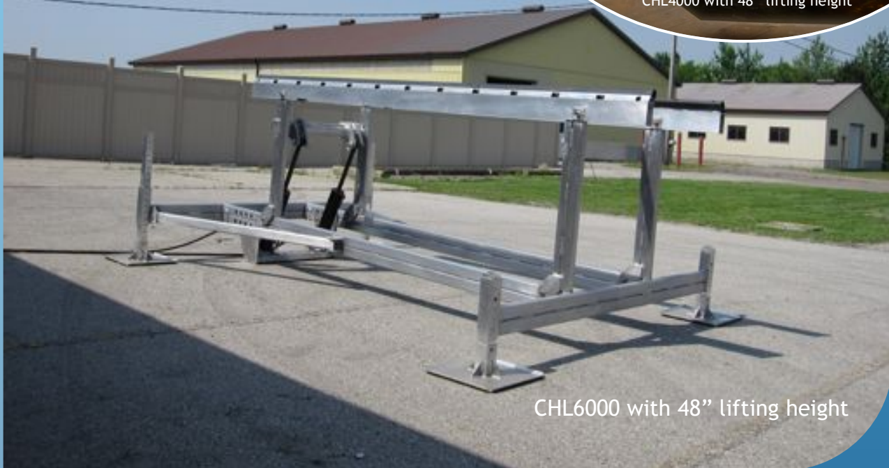
CHL6000 with 48" lifting height